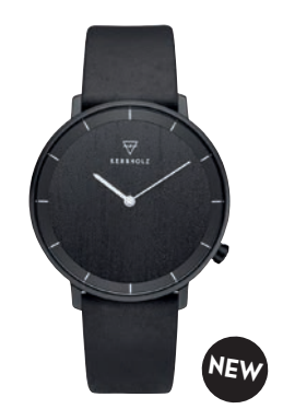
MATTIS DARKWOOD MIDNIGHT BLACK

Case Size: ø 42 mm Strap Material: Leather Strap Width: 20 mm Glass: Mineral crystal with sapphire coating Water Resistance: 3 atm