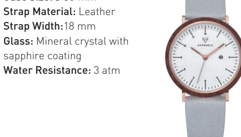
AMELIE WALNUT ARCTIC

Case Size: ø 36 mm Strap Material: Leather Strap Width:18 mm Glass: Mineral crystal with sapphire coating