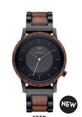
FRED WALNUT BLACK STEEL SOLAR 249 \, \oplus

A complete discharge over a longer period of time can damage the memory cell. When the second hand starts moving at two-second intervals, this is a signal that the energy is beginning to run out.